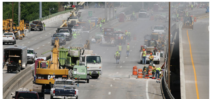
"Clean Construction" would eliminate toxic diesel clouds like these.

A recent Duluth meeting organized by Clean Water Action with U.S. Rep. Jim Oberstar, who chairs the powerful Transportation and Infrastructure Committee laid a solid foundation for this innovative and much needed policy change. Other participants included federal officials, Duluth-area heavy equipment distributors, and pollution control equipment manufacturers. Minnesota's Congressional delegation needs to hear from Clean Water Action members who support "clean construction" measures as part of the Federal Transportation Bill.